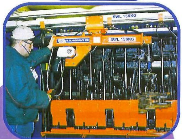
Blankside Hoist System