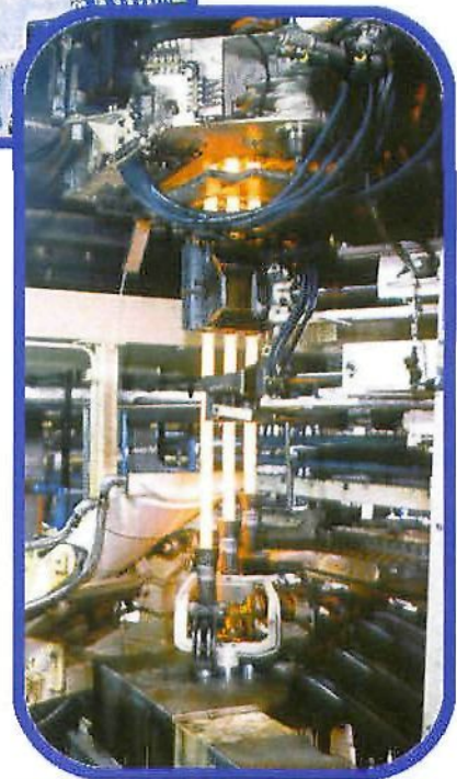
Advanced Loading System