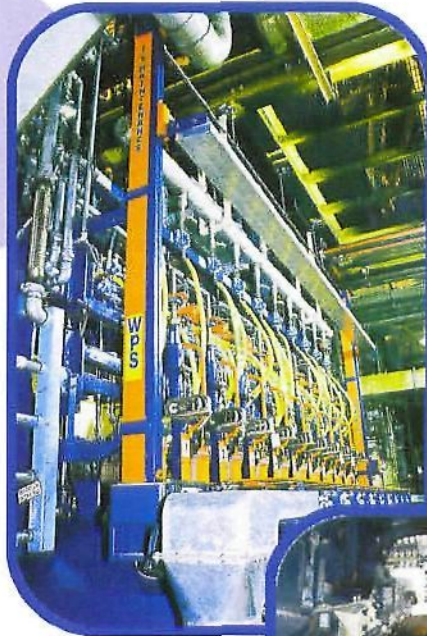
ISM 10-Section 4-1/4" DG Type EF with Ware Protection System